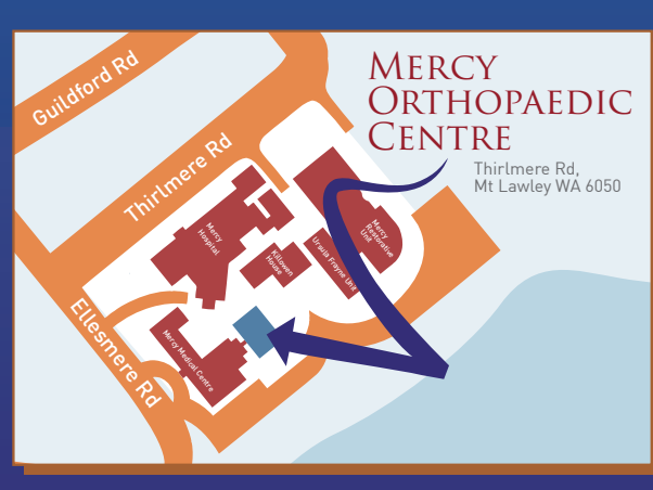
Monday - Friday 9am - 5pm